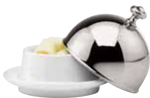
Butterdose, Butter dish, Beurrier 2-tlg., 2-part, 2 parties