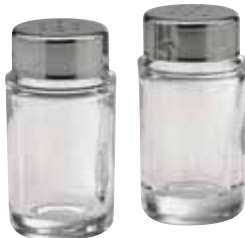
Salzstreuer, Salt shaker, Salière