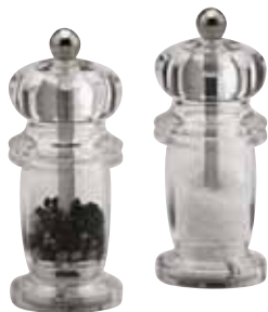
Salz- und Pfeffermühle, Salt- and Pepper mill, Moulin à sel et poivre