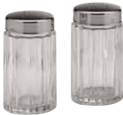
Salzstreuer, Salt shaker, Salière