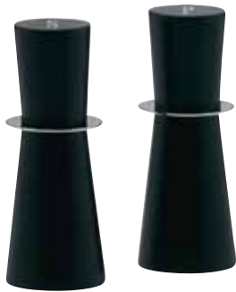
Salzmühle, Salt mill, Moulin à sel