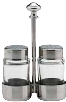
Menage, Cruet stand, Ménagère 2-tlg., 2-part, 2 parties