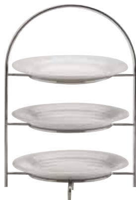
Universalständer, Multi purpose stand, Support universel für Teller Ø 16 cm, for plate Ø 6⅝ inch, pour assiette Ø 16 cm