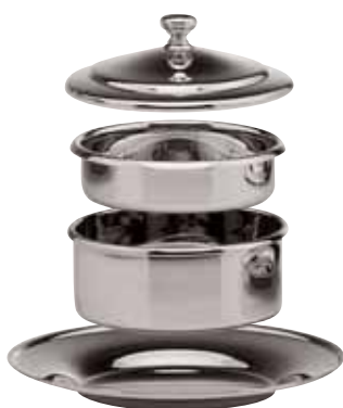
Butterdose, Butter dish, Beurrier 4-tlg., 4-part, 4 parties