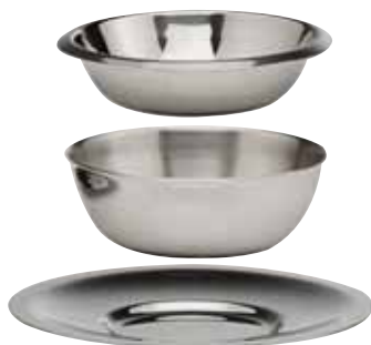
Butterdose, Butter dish, Beurrier 2-tlg., 2-part, 2 parties