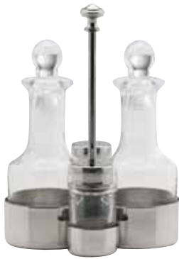
Menage, Cruet stand, Ménagère 4-tlg., 4-part, 4 parties