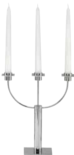
Leuchter, Candelabra, Chandelier ohne Kerzen, without candles, sans bougies Höhe ohne Kerzen, height without candles, hauteur sans bougies