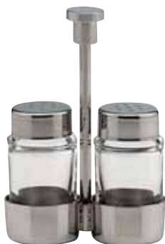
Menage, Cruet stand, Ménagère 2-tlg., 2-part, 2 parties