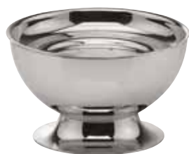
Chillcup komplett für Butter, complete for butter, complet pour beurre