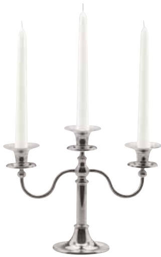
Leuchter, Candelabra, Chandelier ohne Kerzen, without candles, sans bougies Höhe ohne Kerzen, height without candles, hauteur sans bougies