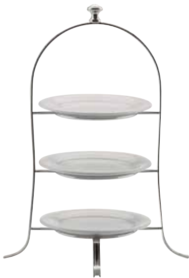
Universalständer, Multi purpose stand, Support universel für Teller Ø 21 cm, for plate Ø 8¼ inch, pour assiette Ø 21 cm