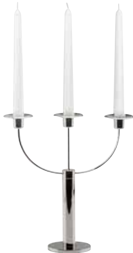
Leuchter, Candelabra, Chandelier ohne Kerzen, without candles, sans bougies Höhe ohne Kerzen, height without candles, hauteur sans bougies